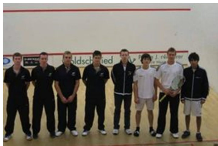
(fourth from left) Representing NZ in 1998 at the World Juniors in Zurich v Canada

Representing Wellington (front and centre, as usual) at the NZ Inter-District Teams' Comp, c. 2008. He's still known to raid his father's wardrobe for a night out.