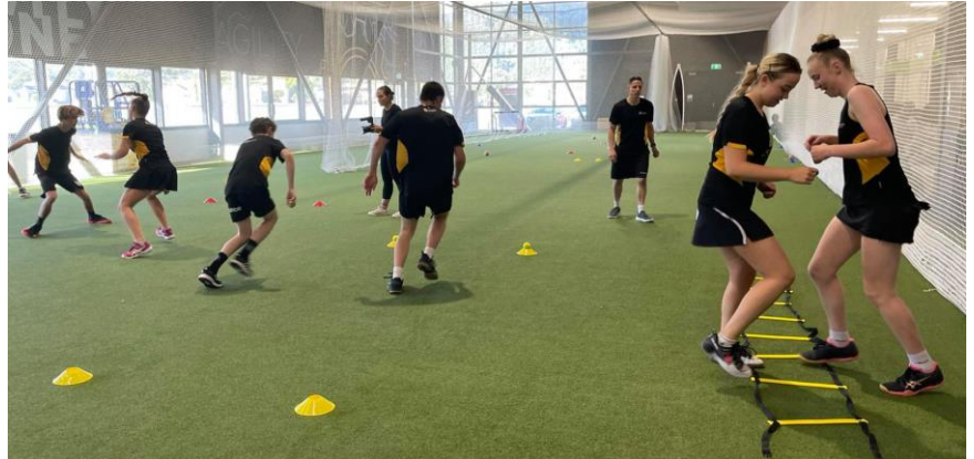
SW Squad Camp at Hutt City