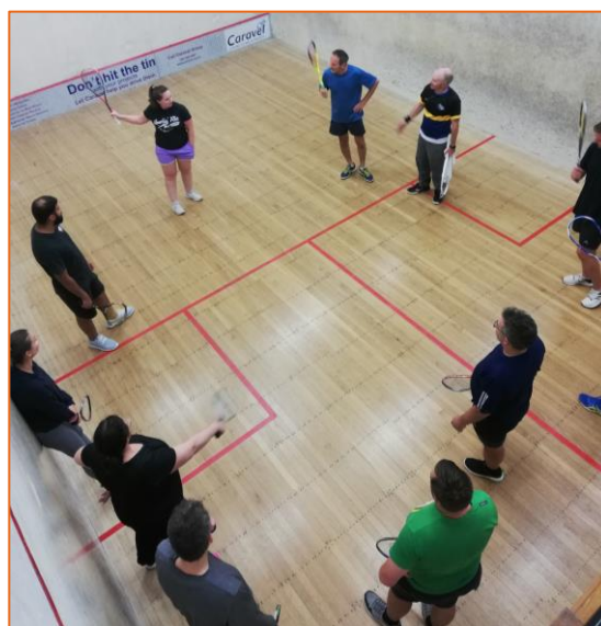
I've got one hand in my pocket and the other one is ghosting a straight drive